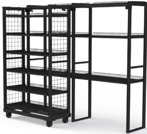
Stockmaster shown in 2/1 configuration