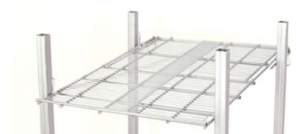
Ability to adjust width. Structure allows units to be merchandised as a shelf with or without a glide or roller