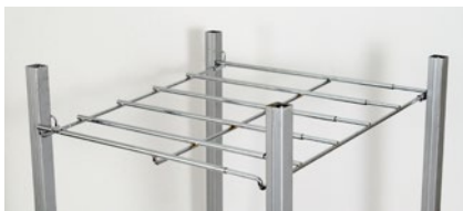
Ability to adjust width and depth *must use with Modular Glide