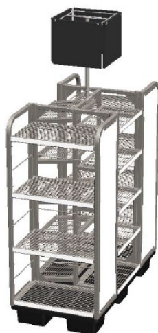
2x4 Metal H-Rack™ with header pole