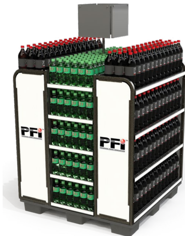
4x4 Metal H-Rack™

Create Destination Points for Value and Convenience Items