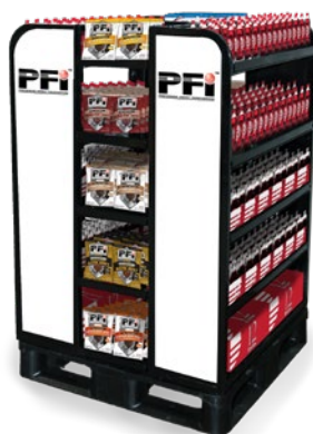
3x3 Metal H-Rack™