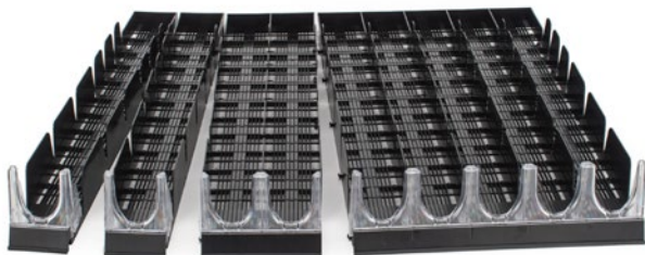
Cool Glide 20/20 shown separated at break off sections. Unit can be configured to fit any size shelf.