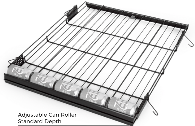
Adjustable Can Roller Standard Depth