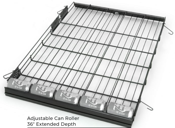
Adjustable Can Roller 36" Extended Depth