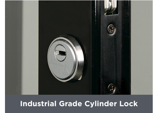
Industrial Grade Cylinder Lock