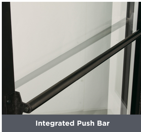
Integrated Push Bar