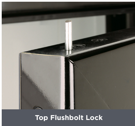
Top Flushbolt Lock