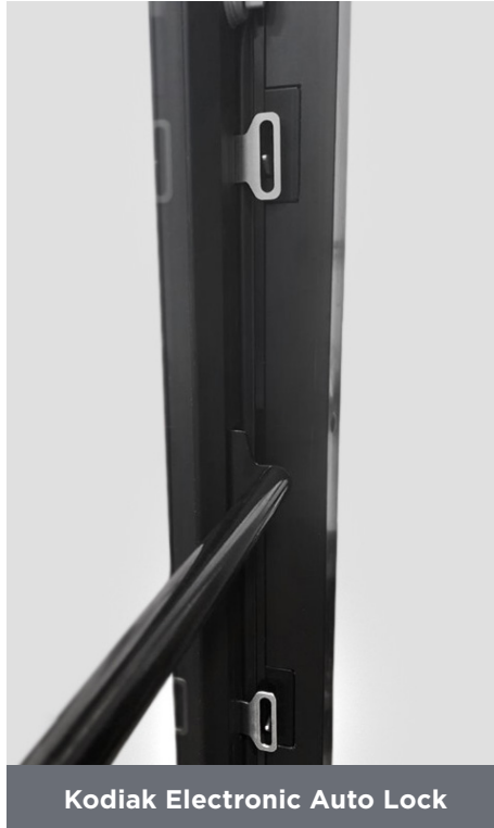
Kodiak Electronic Auto Lock